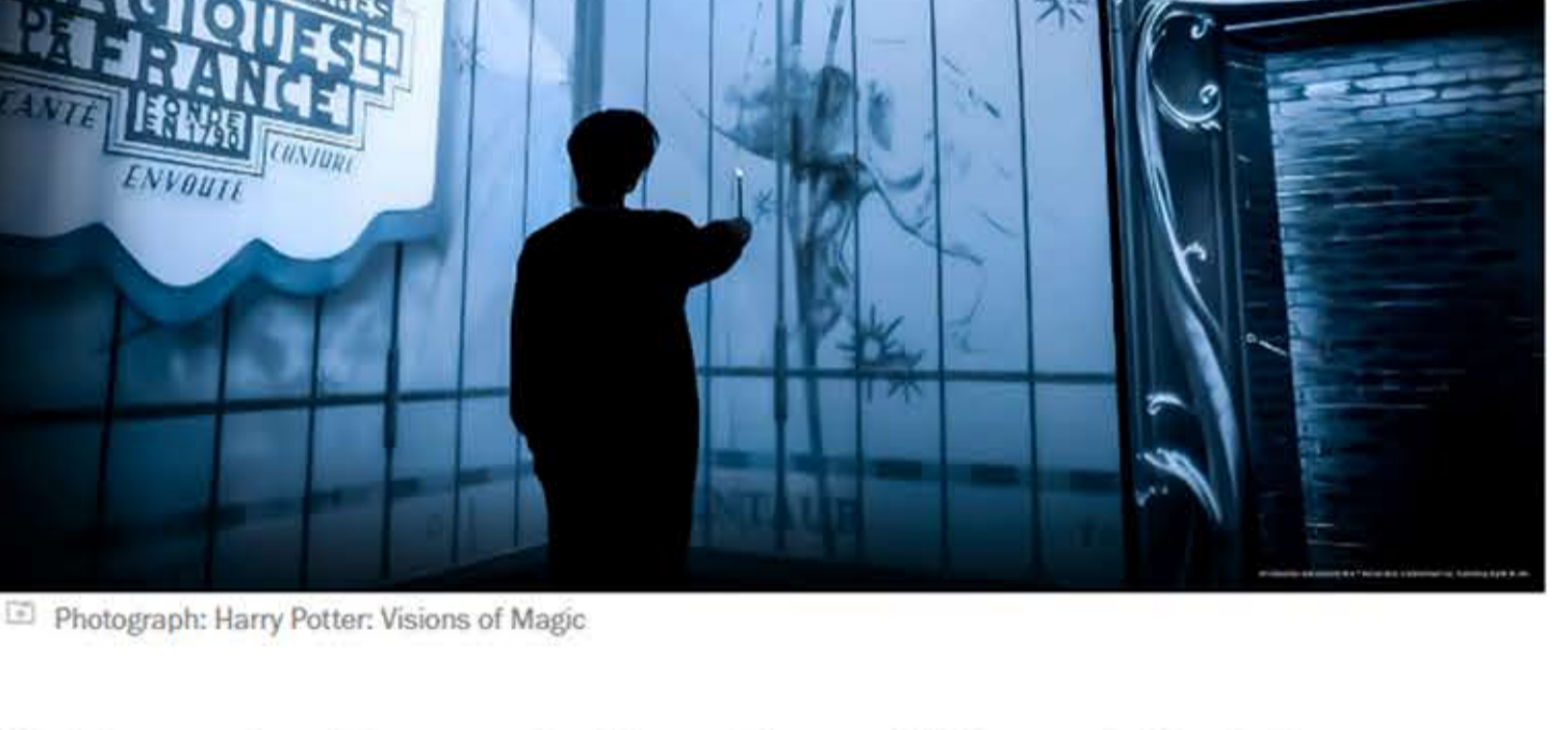
Photograph: Harry Potter: Visions of Magic

Do note that the stated prices exclude a $4 booking fee.