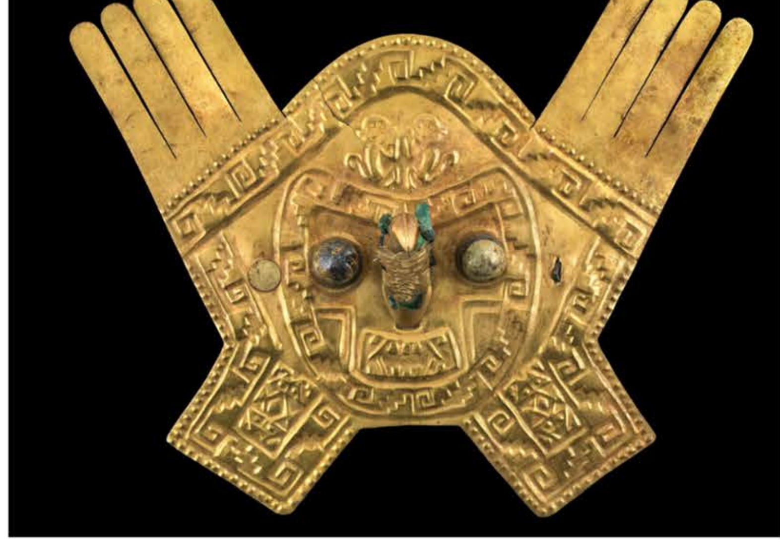
Frontal adornment of gold headdress depicting feline head, Chimú Imperial Period (1300 AD – 1532 AD). Australian Museum's Peruvian exhibition.

Created by Peru's Museo Larco and Museo de Sitio Manuel Chavez Ballon, in conjunction with Neon Global the exhibition features 134 priceless artefacts, including gold treasure from royal tombs, glittering jewels, intricate masks and objects of worship, explains the Museum.