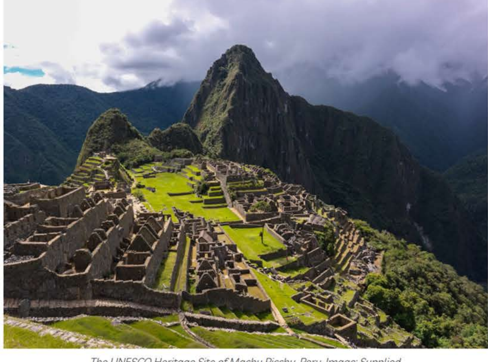
The UNESCO Heritage Site of Machu Picchu, Peru.

Visitors can then walk through the exhibition of rare antiquities, dating back more than 3000 years and stretching across five Peruvian Empires.