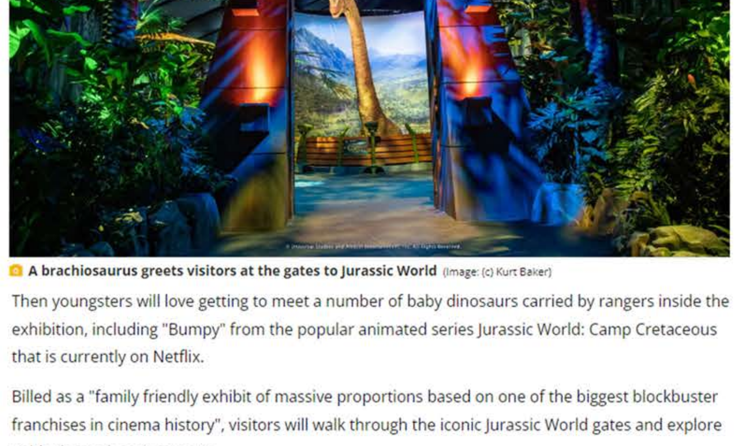
A brachiosaurus greets visitors at the gates to Jurassic World

Ticketholders get to walk through a series of different rooms within the attraction, including a science lab where the Jurassic World boffins hatch new baby dinosaurs. Visitors will also get to scan eggs to see which baby dinos are inside.