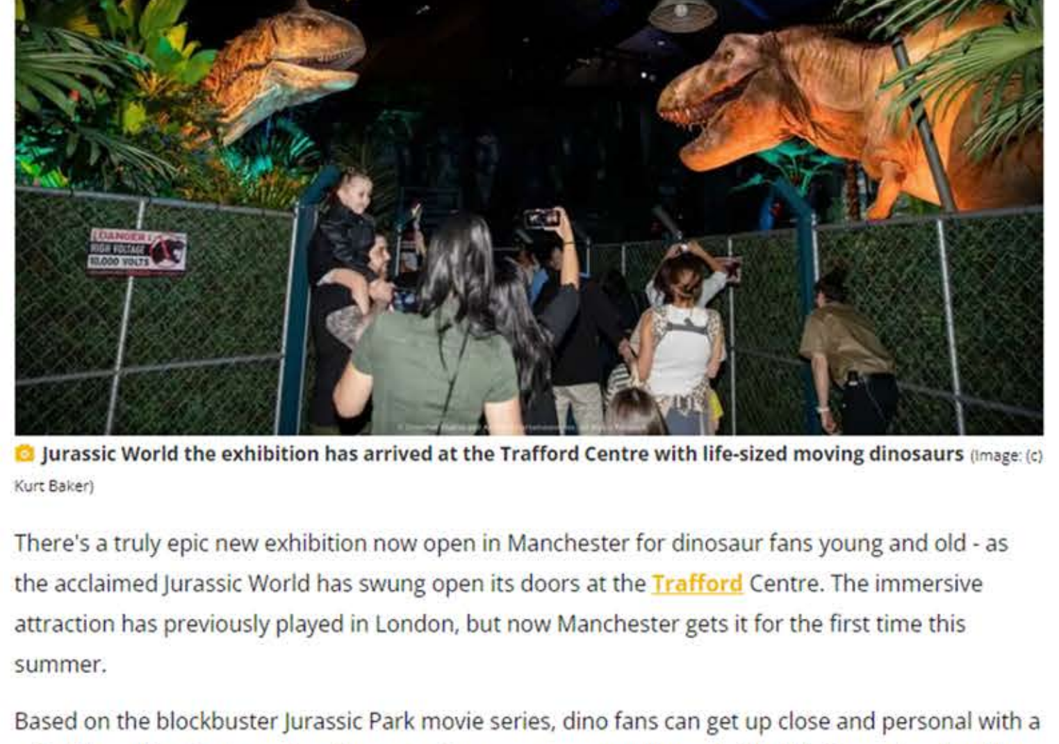
Jurassic World the exhibition has arrived at the Trafford Centre with life-sized moving dinosaurs