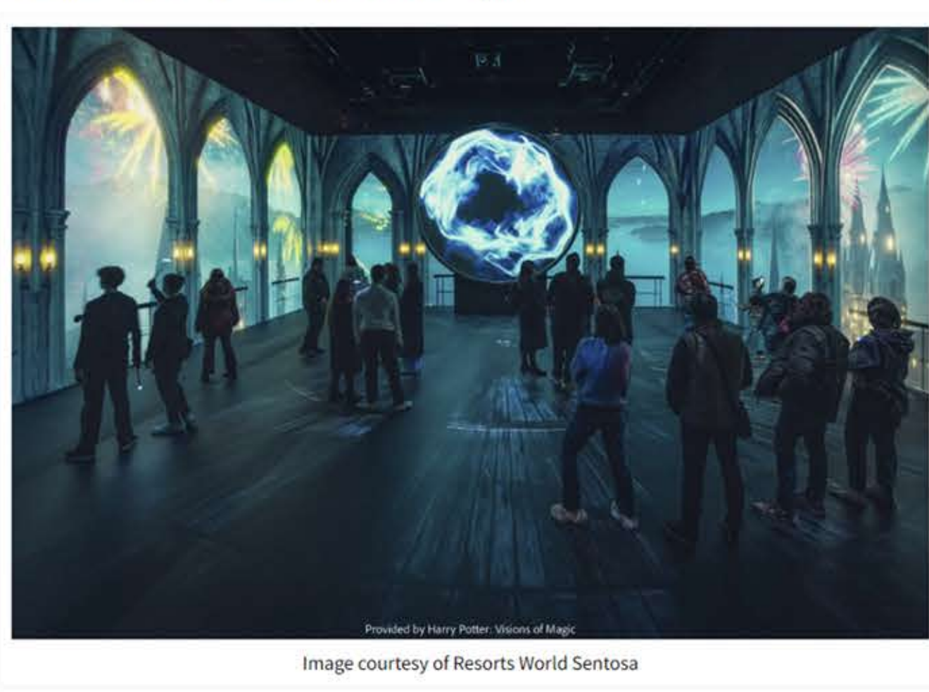
Provided by Harry Potter: Visions of Magic

If the experience in Germany is anything to go by, you can expect familiar iconography such as the Daily Prophet covers, Black family tapestry, and the brilliantly purple Knight Bus.