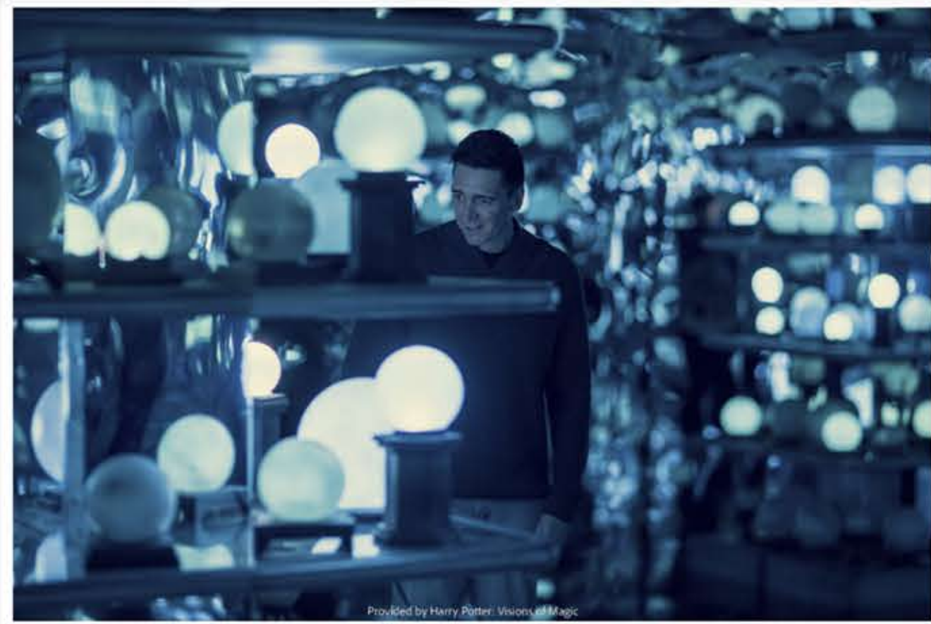
Provided by Harry Potter: Visions of Magic

Guests will also be able to interact with the technology, and be awestruck by the revealing visions of magic.