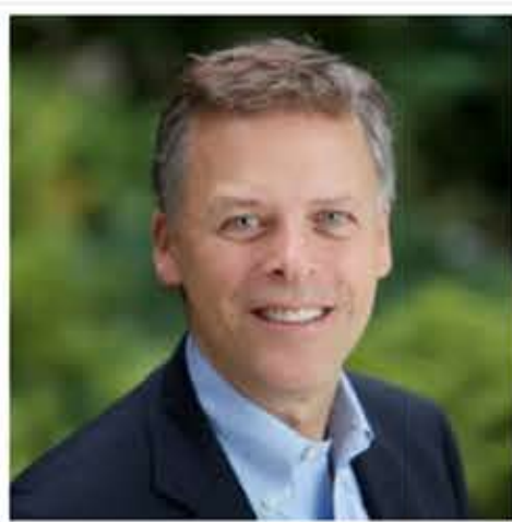
Peter van Roden

Neon says that the show will feature a series of immersive environments inspired by enigmatic places in the magical community, like the 'Room of Requirement', 'Newt's Menagerie' and the 'Ministry of Magic'.