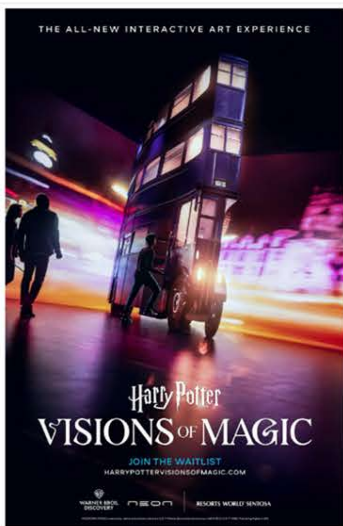
The multimedia show will be featured within RWS beginning in fall of 2024.

Following the success of its world premiere in Germany, Harry Potter: Visions of Magic will now be showcased in Southeast Asia at Singapore Resorts World Sentosa.