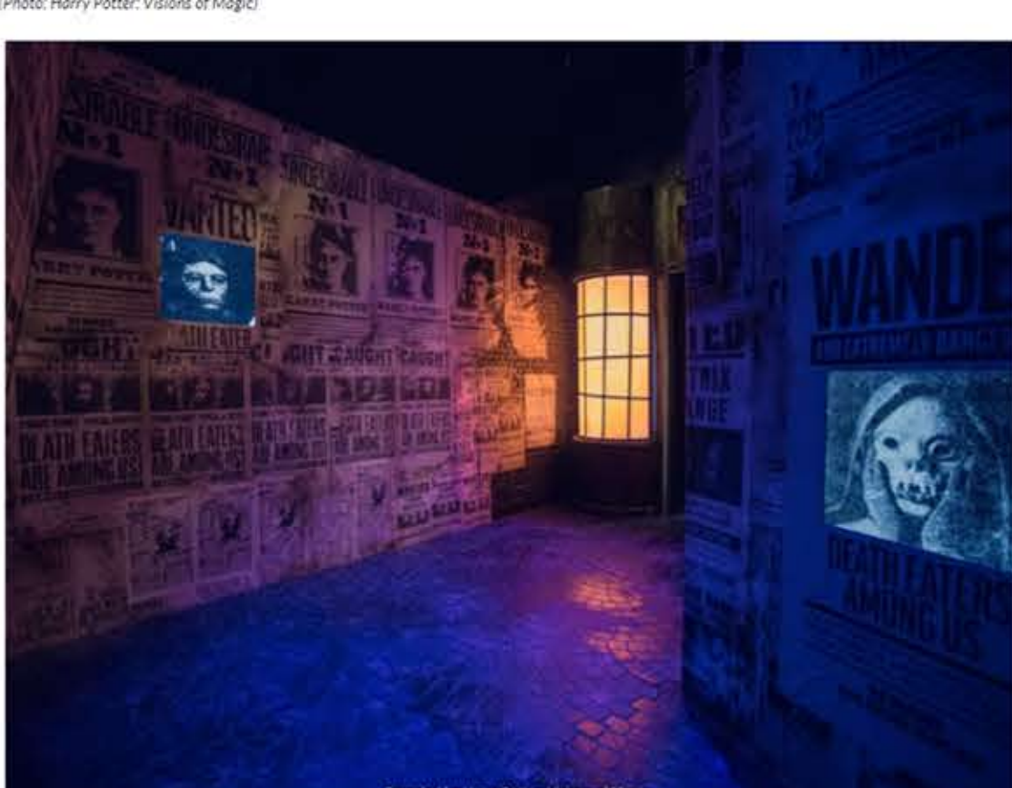
Provided by Harry Potter: Visions of Magic