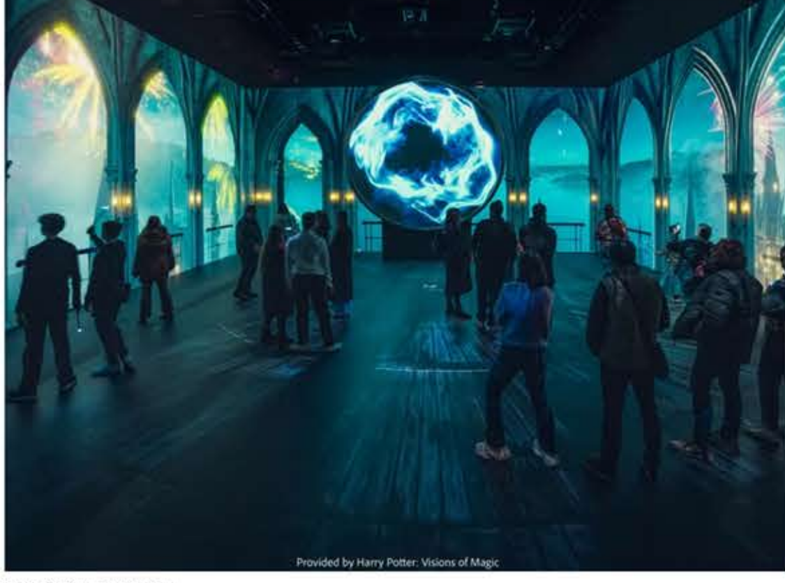
Provided by Harry Potter: Visions of Magic