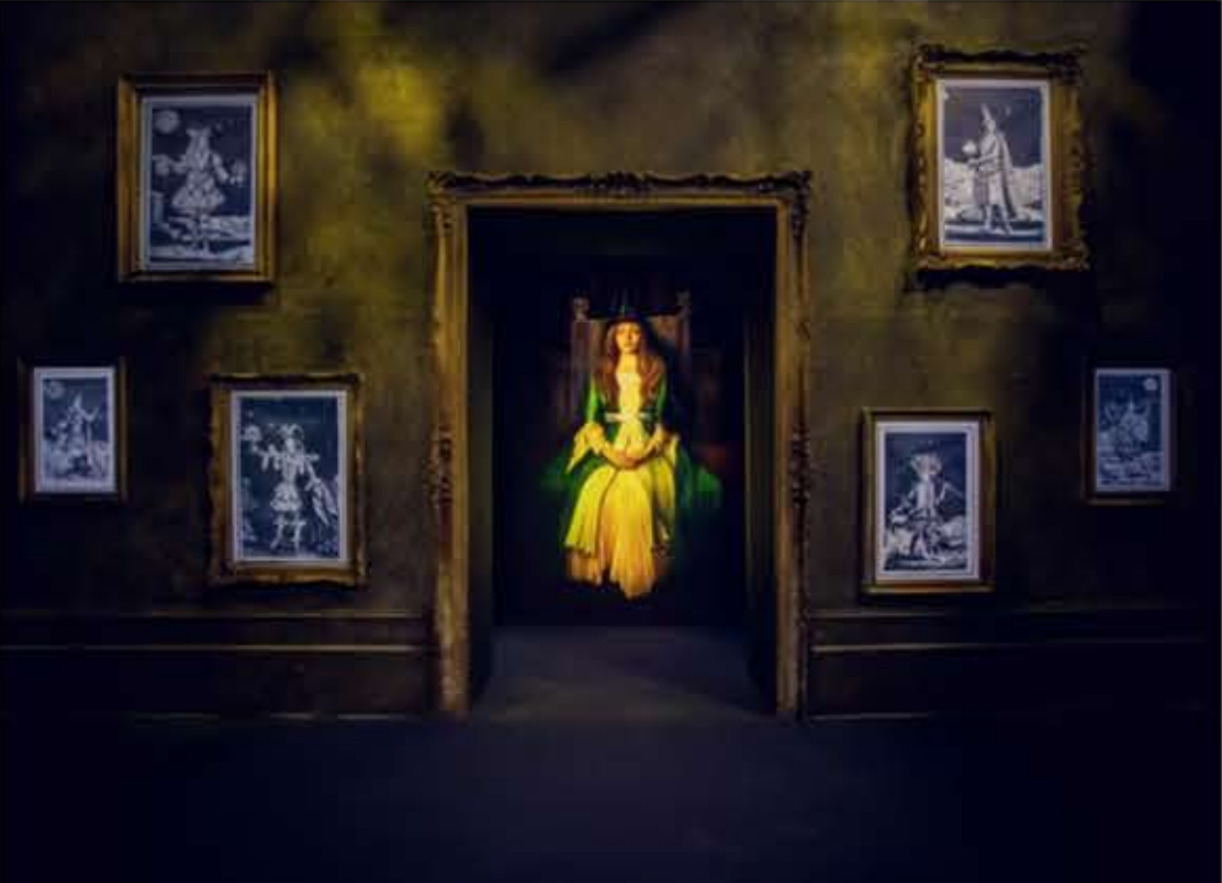
Provided by Harry Potter: Visions of Magic