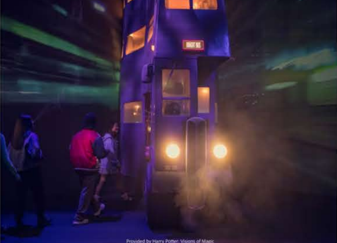
Provided by Harry Potter: Visions of Magic