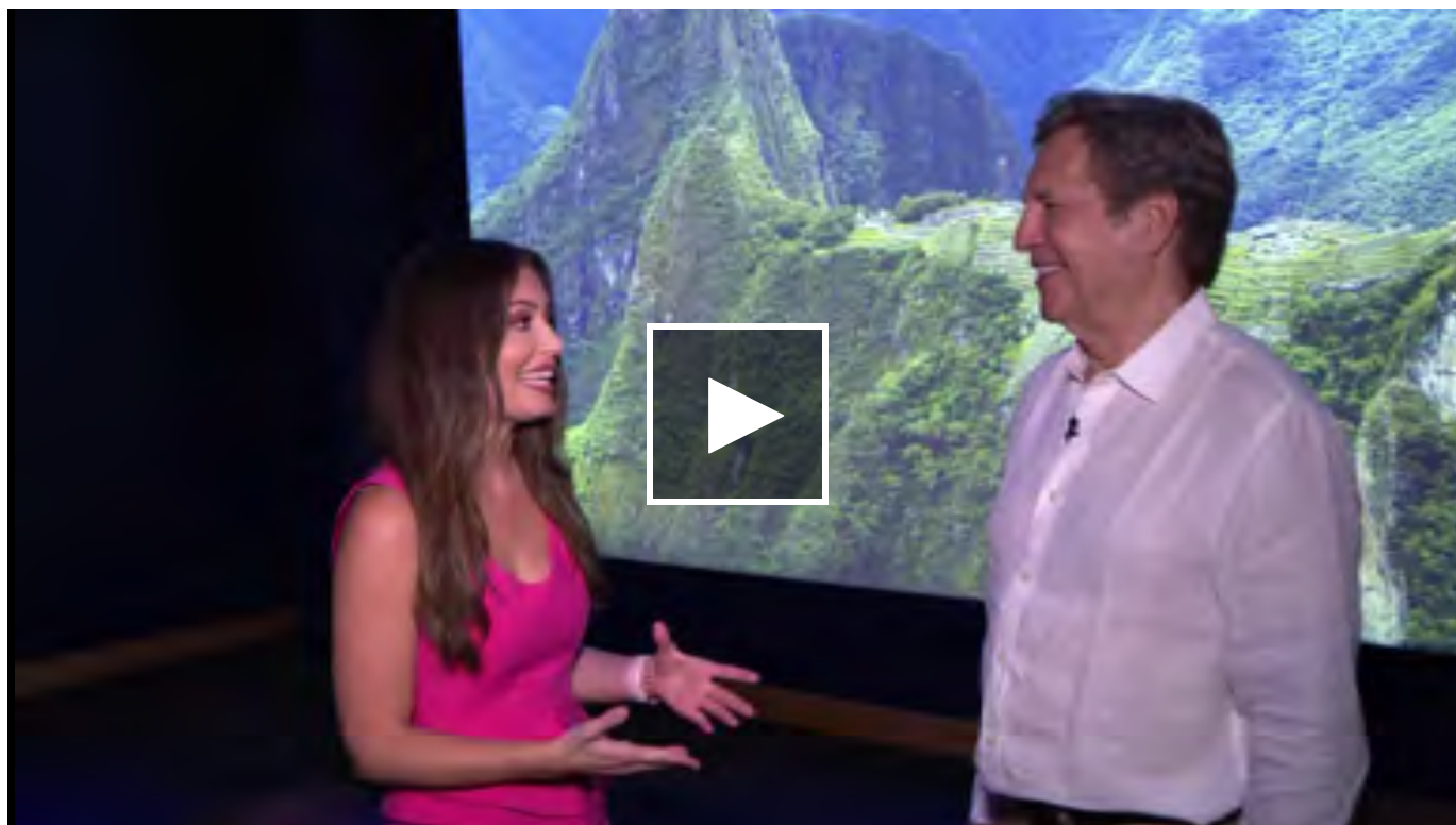
CBS12 News takes you inside the Machu Picchu Exhibit at the Boca Raton Museum of Art. (WPEC)

In a first of its kind, the exhibit features virtual reality that will place visitors in the heart of Machu Picchu - one of the 7 wonders of the world.