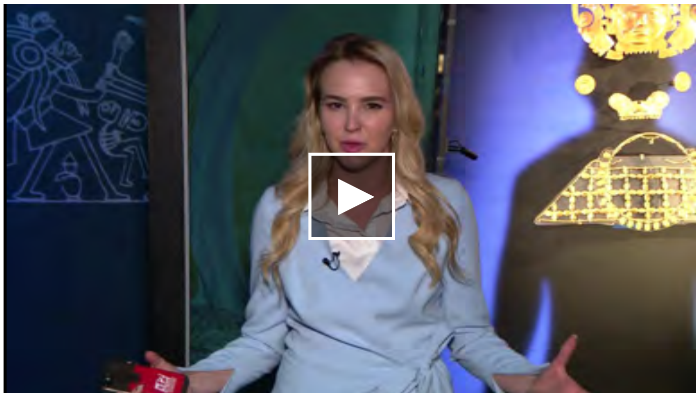
A closer look at the Machu Picchu Exhibit at the Boca Raton Museum of Art.

Visitors will be led through the immersive experience with the sights and sounds of ancient Peru.