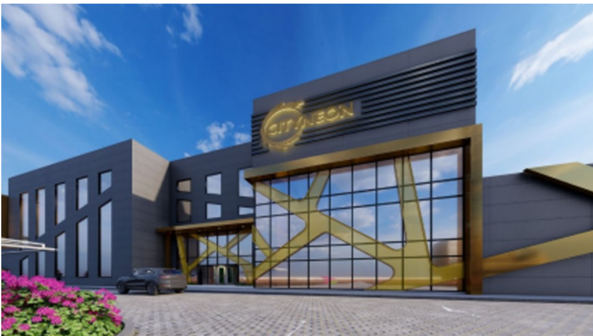
Concept visualisation of the new site

Cityneon's new 15,000 square metre facility will be constructed in the Ras Bufontas Free Zone, featuring an international experience and entertainment technology centre, an R&D innovation lab developing animatronics and robotics, and a production workshop.